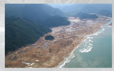
The Banda Aceh tsunami of 26 December 2004 travelled inland hundreds of meters and killed more than 100,000 people in Indonesia.