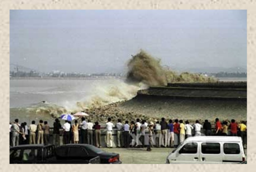
Never stand near the shore to watch an approaching tsunami!