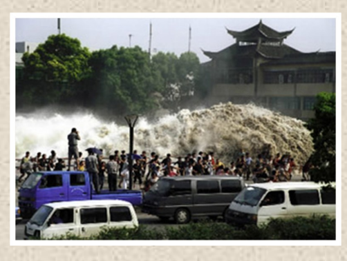
You cannot outrun a tsunami once it reaches the shore!