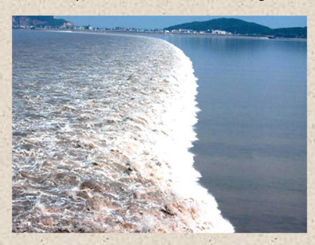
A big tsunami wave can travel up to 15 m in 1 second!